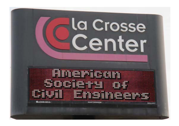
The La Crosse Center was a fantastic venue.