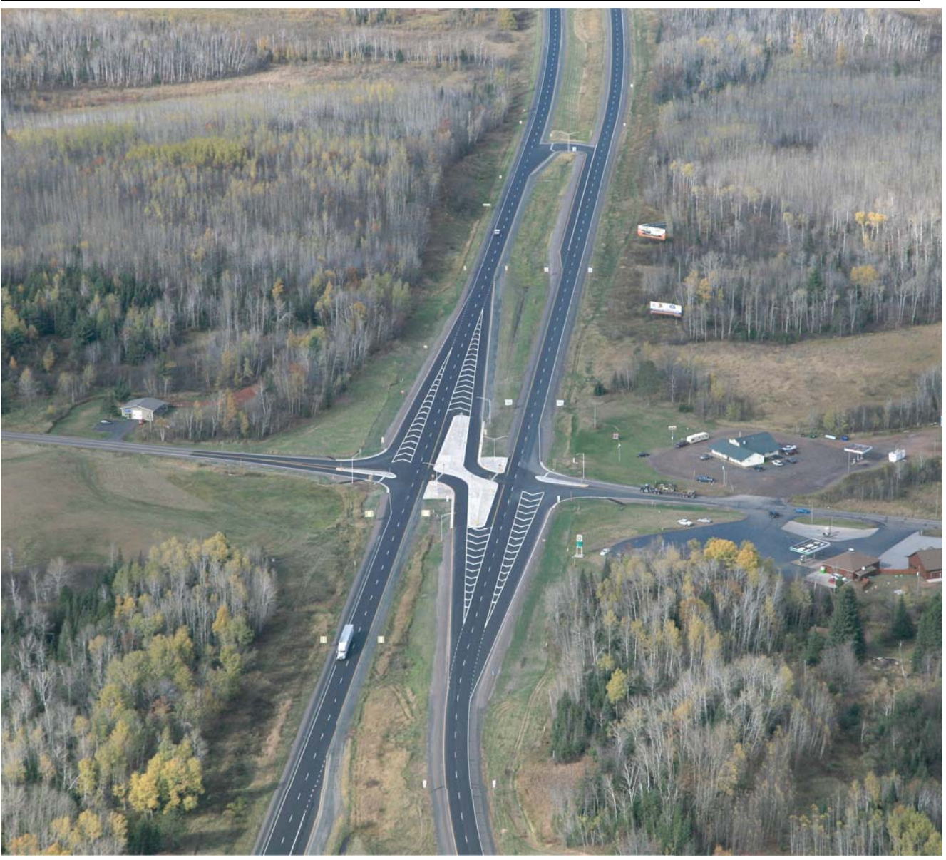
Project overview: J-turn in Douglas County.