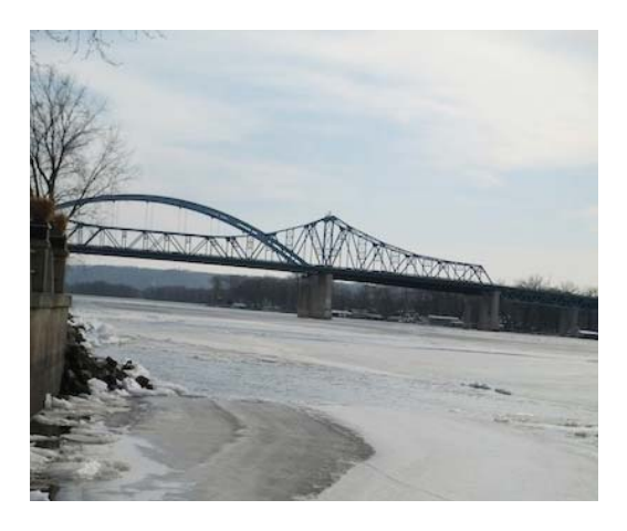
Beautiful La Crosse civil engineering landmarks (Cass Street bridges) were another highlight of a great day!