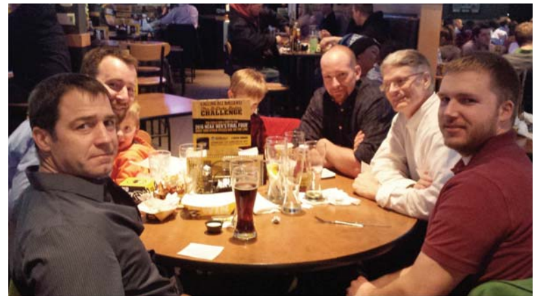
La Crosse Social: Tuesday, February 24th