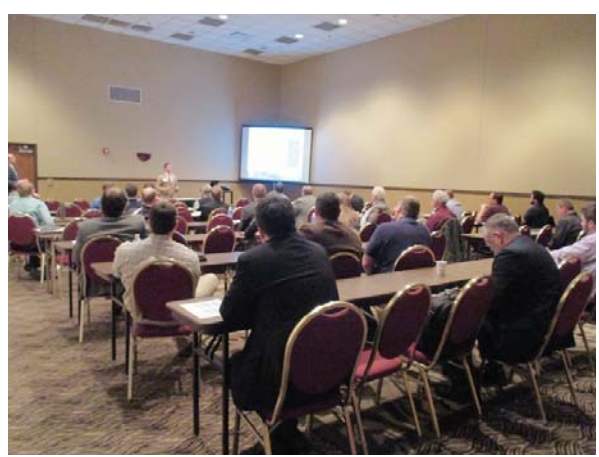
The STC had excellent technical sessions.