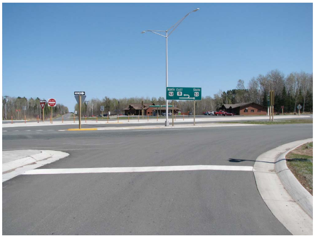
Street view of the J-turn construction and signage.

Construction was complete on October 8, 2011.