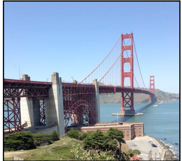
My favorite shot from a recent trip to the Bay Area.

We are seeking Northwest Branch Board Members for the 2013-2014 year. Normally this is the time of the year when we send out nomination info to our members. This year we have had no one nominated or stand up to take on a leadership role. We are making one last call for nominations for the open positions of Secretary/Treasurer, President-Elect and Director. Please consider nominating yourself or someone you know for the Board.